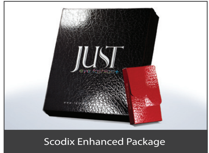
Scodix Enhanced Package

The back side coverage of the brochure with Scodix SENSE™ is 0.65% from A4.